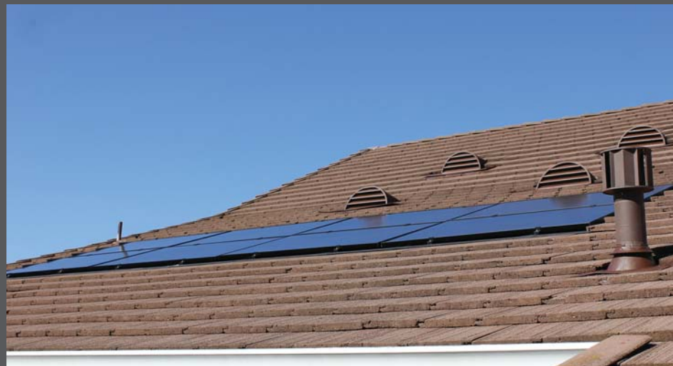
SUNMIZER FOR CLAY OR CONCRETE TILE ROOFING