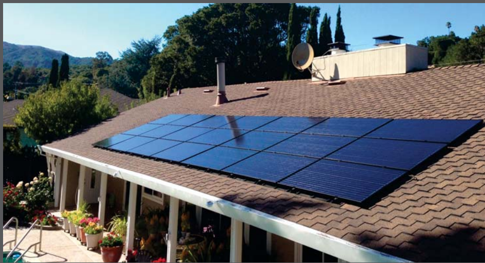
SUNMIZER FOR COMPOSITE SHINGLE ROOFING

Attractive, Tested, Certified and AFFORDABLE: Roof integrated SunMizer Solar Roofing Systems are a cost competitive, affordable way to integrate solar into the building envelope as a standard or optional feature (with a new roof or as a retrofit to an existing roof). Systems start at around $7,000 (after federal incentives) for a basic 8 panel system. The SunMizer roofing component replaces an area of roofing material equal to the system footprint. Any cost differential between SunMizer and traditional solar mounted over the existing roof, is generally offset by this replacement.